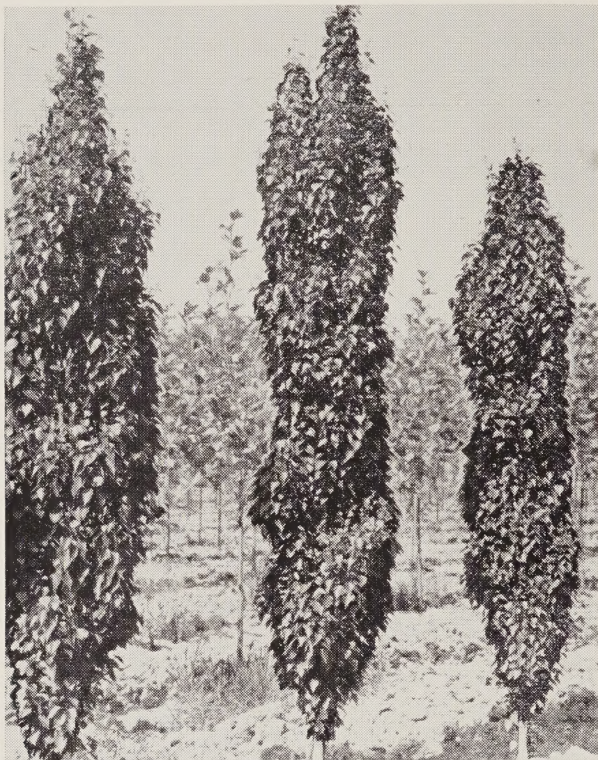
Column European White Birch — An outstanding accent tree.